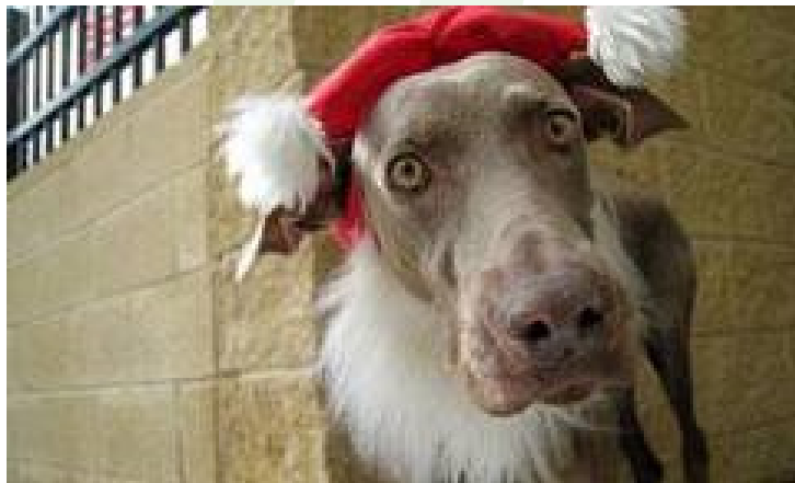
Rockwall Kiwanis Christmas Parade (Texas)

Kiwanis Clubs all over America host Christmas Parades, Festivals, and other Holiday Events.