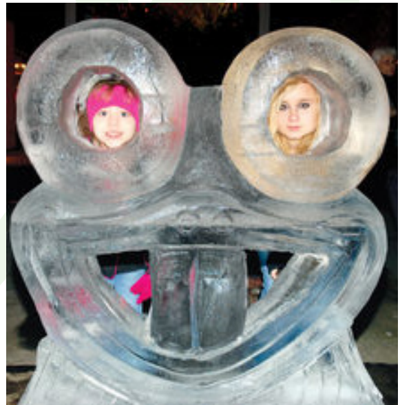
Lewiston Festival of Ice and Kiwanis Christmas parade (Pennsylvania)