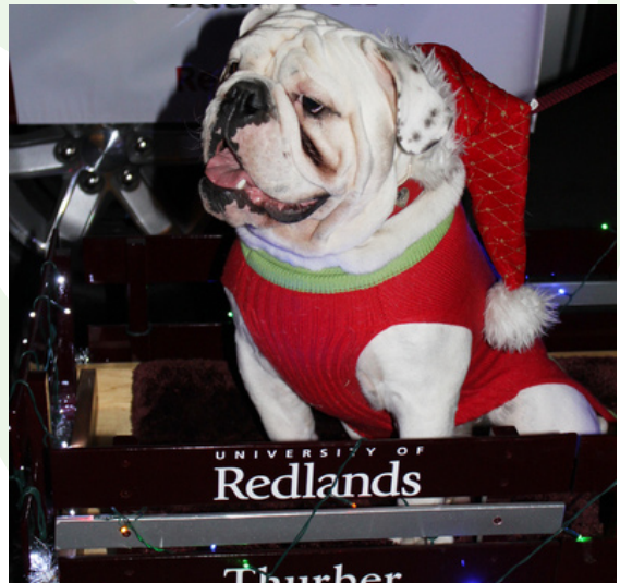
University of Redlands bulldog mascot Thurber, wearing his holiday best, proudly participated in the Redlands Kiwanis Annual Christmas Parade (California)

Kiwanis Clubs all over America host Christmas Parades, Festivals, and other Holiday Events.